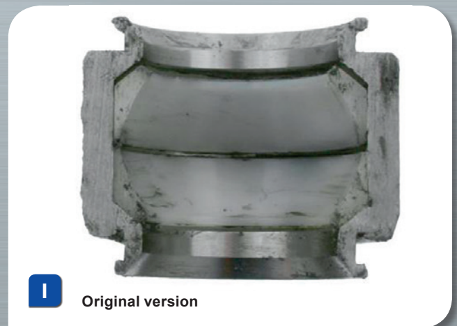
1 Original version