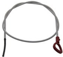
SWAG 10 93 8023