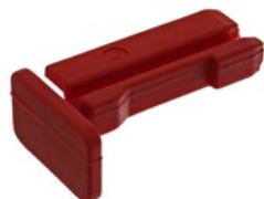
SWAG 10 94 4204

The oil level in an auto gearbox should be checked after an oil change or if there is a suspected leak. No dipstick is provided for the gearbox at the factory.